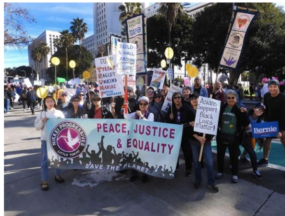
taken January 2020

joint committee and are preparing to draft a statement that can be used in future workshops.